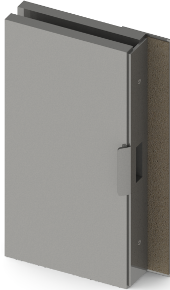
Manual strike with stop Non-handed